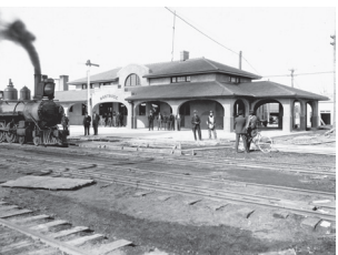
Denver Rio Grande Depot;

History buffs will want to be sure to take the self-guided walking tour of downtown Montrose. Consisting of 12 interpretive signs within a five-block area of Downtown Montrose, the tour brings visitors along the well-preserved blocks of Main