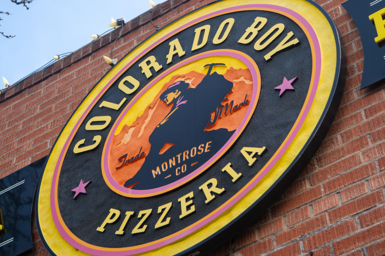
Colorado Boy Pizzeria

Evenings at elevation, even on hot summer days, cool off significantly thanks to the lack of humidity, but it will likely still be warm enough and early enough to sample Montrose's most recently-opened watering hole.