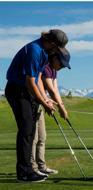
VisitMontrose.com, The Bridges

As for where to rest what is sure to be a weary head after a busy day, Montrose has plenty of accommodation options, but perhaps the best located is Canyon Creek B&B. Right on Main Street (a few doors down from Horsefly), there are two properties side by side. There are also seven unserviced suites available at The Bridges golf course (the views of the San Juan mountain range cannot be beaten). Hardier souls may want to sleep under the stars at the Black Canyon of the Gunnison National Park where early risers will witness what is sure to be another glorious sunrise in the Centennial State.