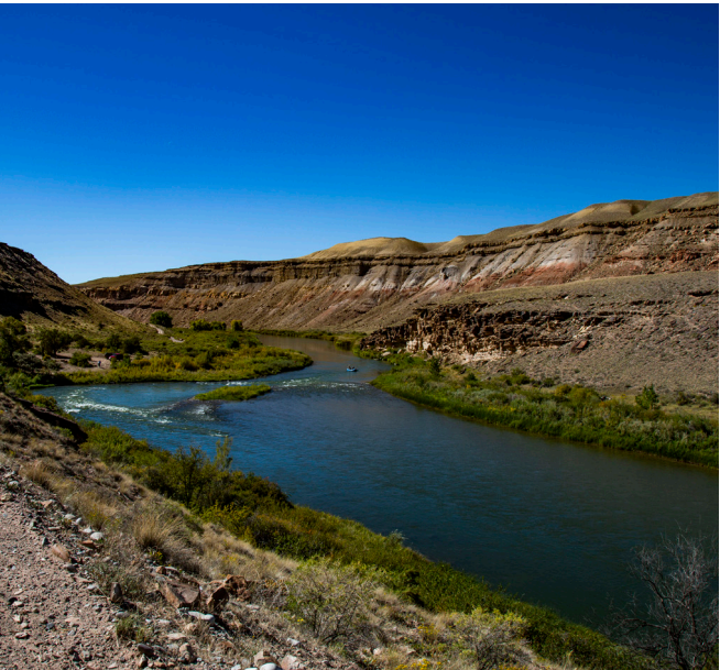
Gunnison Gorge National Conservation Area

With so much history in the region, it's no surprise there are a few museums in and around town. The Montrose County History Museum, located in the old rail depot right downtown, offers an interesting array of artifacts from the past. A few miles East of town is the Museum of the Mountain West. An homage to the region's pioneers, there are hundreds of items that chart the town's history as a bona fide western town including a reproduction of an old west town with a saloon, a general store, and an apothecary. They offer guided tours, too. The newly renovated Ute Indian Museum south of town is another great attraction that chronicles the region's native inhabitants. Offering insight into the Native American tribes who lived in the area, the museum is great for families and anyone interested in the heritage of the Colorado Ute Indians.