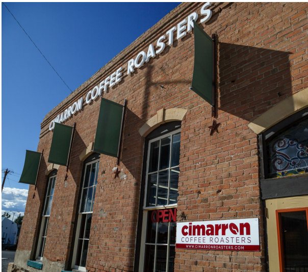
Rachel Oftedahl, Cimarron Coffee Roasters

With some Colorado cherries or perhaps a Palisade peach in-hand, stroll down the town's historic Main Street. Browse the collection of little boutiques along the town's most aesthetically pleasing two blocks or stop in and peruse with purpose. The Green Cupboard, a jewelry and accessories store that benefits Sharing Ministries Food Bank; and Heirlooms for Hospice, which sells all kinds of wares including furniture, home décor, and gently used clothing and antiques to support local non-profit HopeWest, are first. On the next block is SheShe Boutique, Country Flair, Fabula, and Ouray Silversmiths. Be sure not to miss Straw Hat Farm Market & Kitchen Store. Located a block south at 514 South First St, the quaint shop offers some of the the best baked goods in town.