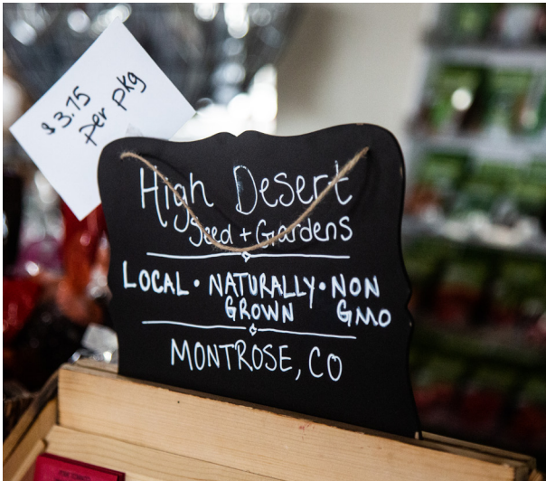
Straw Hat Farm Market & Kitchen Store