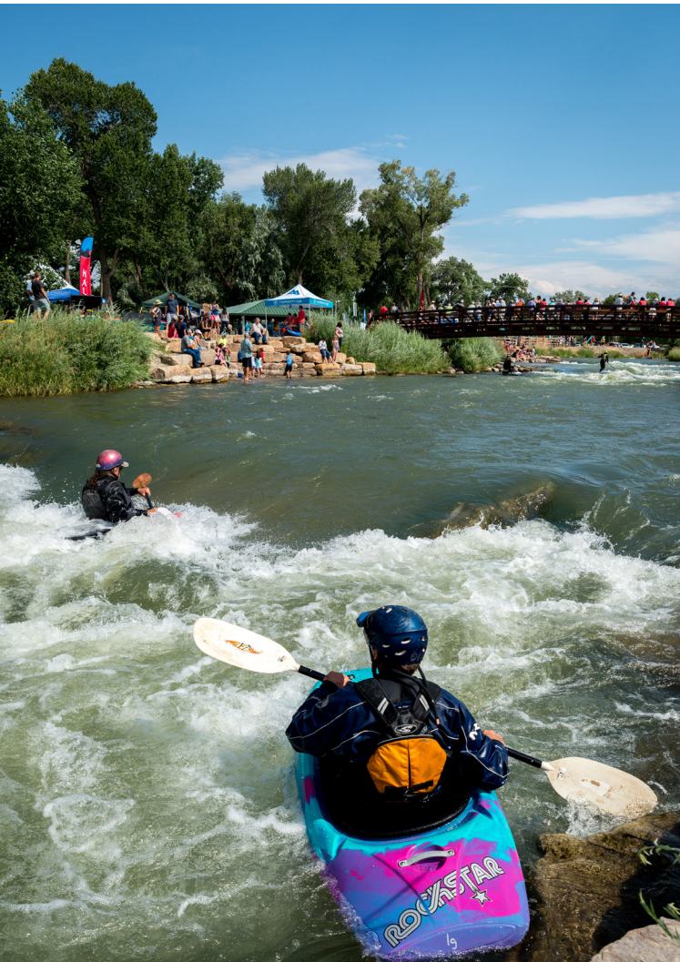
Montrose Water Sports Park

Adjoining the Vine Market and Bistro is Maggie's Books, a very welcome and very recent addition to downtown. The selection of books on local history, culture, and nature will likely be of interest to those from out of town, state, and country. Give yourself at least 15 minutes of post-lunch browsing time.