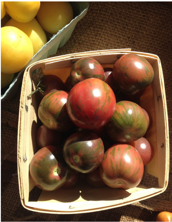
Montrose Farmers' Market