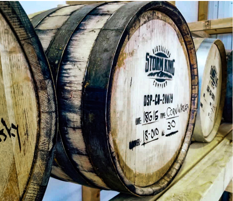
Storm King Distillery Co

After a few pints (regular or English), it will be just about time for dinner. Trattoria di Sofia is a few blocks away and is a popular spot. The humble-looking restaurant contains an equally humble-looking menu, however, the dishes are much more than the sum of their parts.